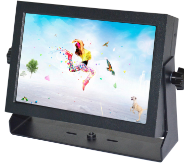
RMS1A with Desktop Accessory