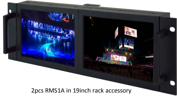
2pcs RMS1A in 19inch rack accessory